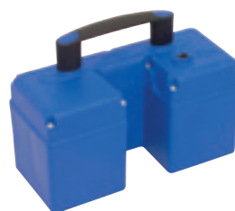
Quick-change battery unit BU PT 5,2 Ah

weight 4.3 kg, capacity 5.2 Ah, voltage 24 VDC Art. No. 004 150