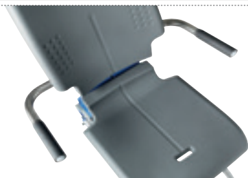
Armrests with wider spacing

standard width 44 cm, extended to 54 cm Art. No. 945 146