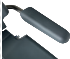
Armrests with soft padding