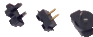
Charger unit adapter

5-point belt system, Art. No. 945 144 / Waist belt, Art. No. 945 118 / Waist/chest belt, Art. No. 945 158