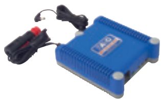
In-car charger unit BC 10-30 VDC-PT

weight 4.3 kg, capacity 5.2 Ah, voltage 24 VDC Art. No. 004 150