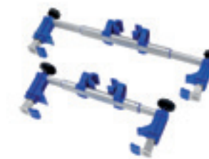
Retention clamp for PT Uni

UK plug, Art. No. 045 142 / USA plug, Art. No. 045 143 AUS plug, Art. No. 045 144