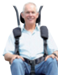
Range of belt systems

standard width 44 cm, extended to 54 cm Art. No. 945 146