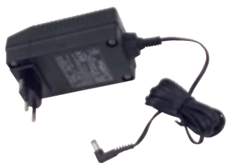
Mains charger unit BC-PT with Euro plug

Accessories for LIFTKAR PT stairclimbers are specifically designed to cater for the individual needs and requirements of people with walking difficulties. The quality of the technical solution and design are of the utmost importance.